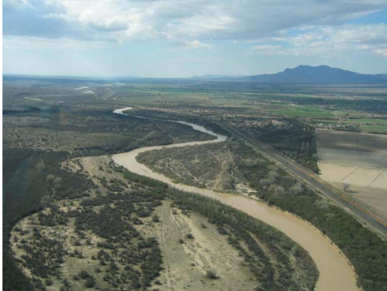
Figure 1. The Middle Rio Grande near San Acacia